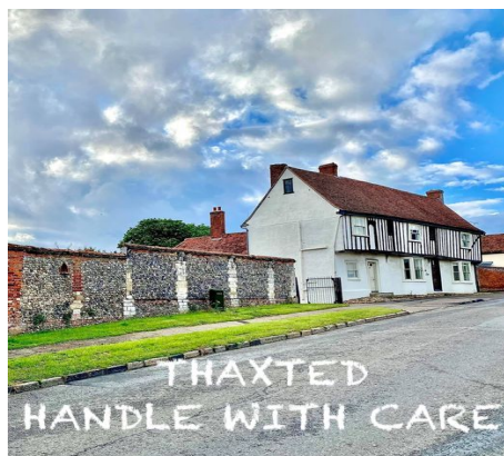
Park Farm a fine example of restoration conservation and sympathetic development.