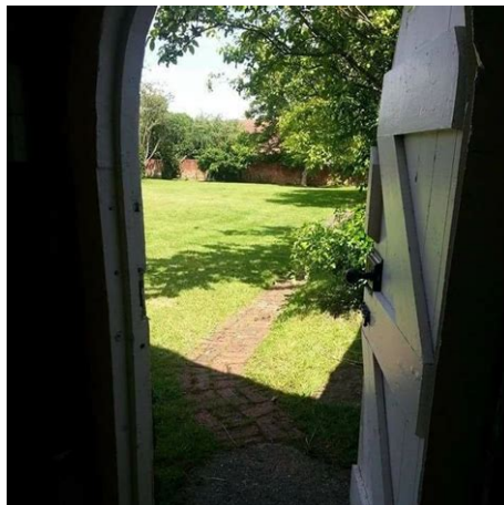
...the secret door to the secret garden