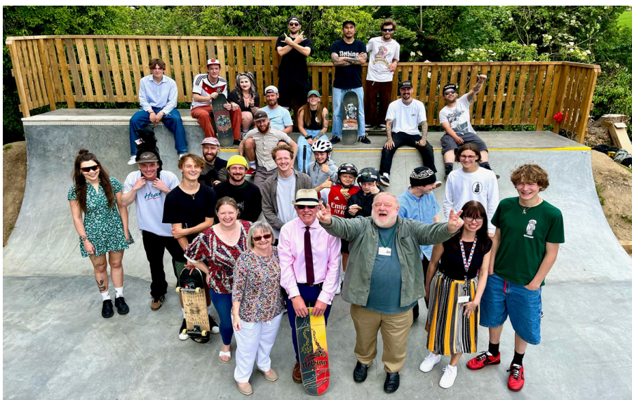
The new Youth Club skate ramp, an important volunteer driven amenity for Thaxted