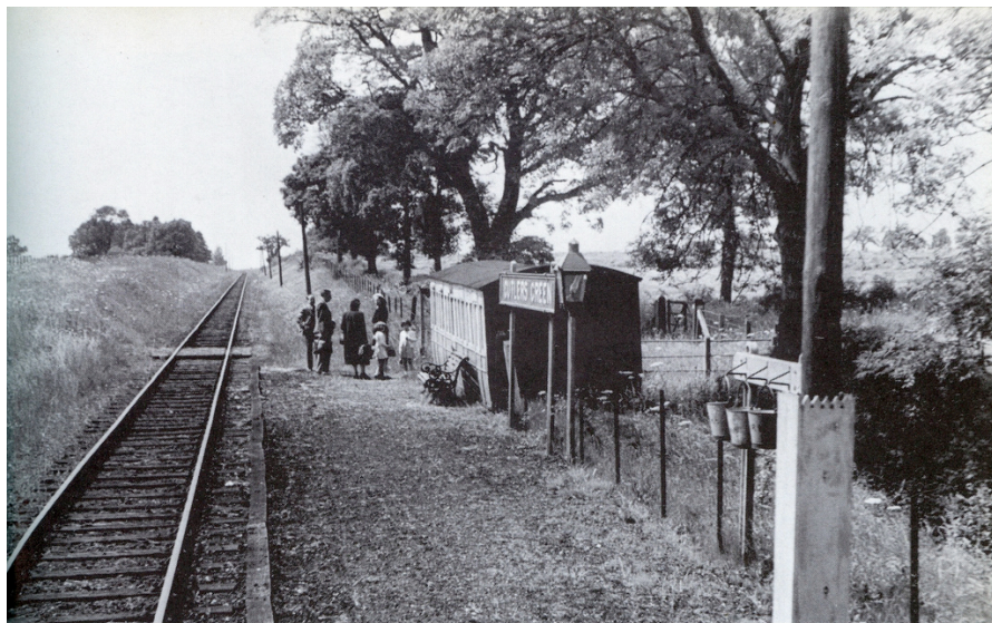
... waiting for the train at Cutlers Green.