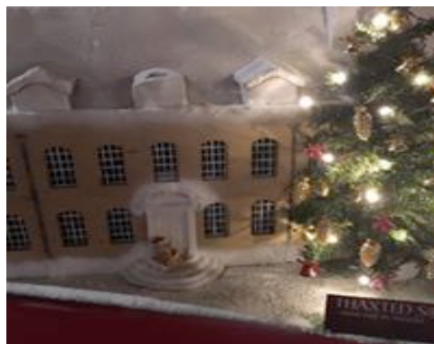
The Thaxted Society's Christmas Tree at the Church Christmas Tree Festival