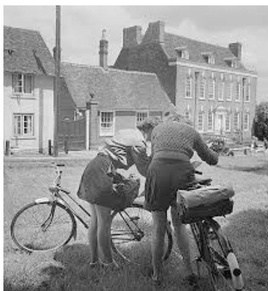
... a days cycling pauses in the shade of Thaxted Church.