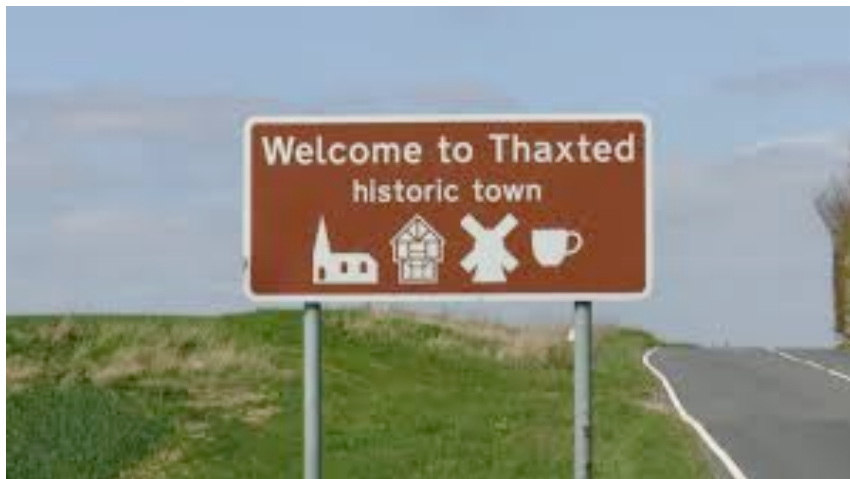
Thaxted welcome signs cleaned by The Thaxted Society

(Subscriptions to The New History of Thaxted will close in June).