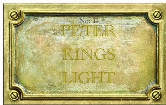
a sketch example of a plaque 9x6cm

Demonstrating our care in order to ensure the co-operation of ECC Highways and all Authorities