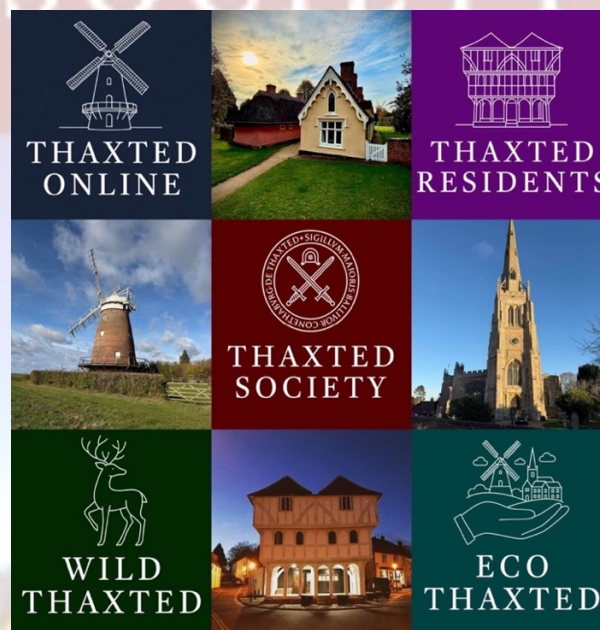
A wonderful example of excellent rebranding