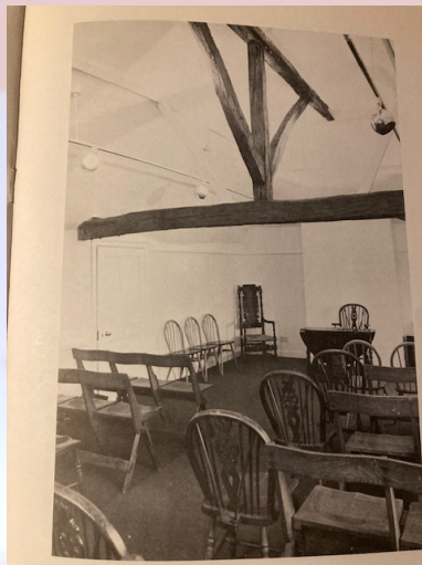
The Guildhall upper room as Council Chamber.